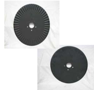
18" and 20" Plain and Fluted Discs

All twin coulters have an off vertical angle applied to the disc, this assists with keeping discs sharp and clean.