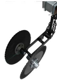
Twin Disc Coulters—Setback PWTRAILCOULTERTWINPL - 18" Plain PWTRAILCOULTERTWINFL - 18" Fluted

Disc position setback behind mounting bar.