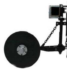
Single Disc Coulters—Setback PWTRAILCOULTSINGLEPL - 18" Plain PWTRAILCOULTSINGLEFL - 18" Fluted

All twin coulters have an off vertical angle applied to the disc, this assists with keeping discs sharp and clean.