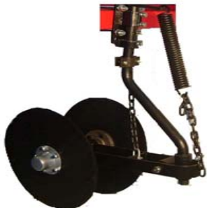
Twin Disc Coulters—Set-under PWCOULTERTWINPL - 18" Plain PWCOULTERTWINFL - 18" Fluted

Plain versus Fluted. Generally the fluted disc will cut better and has a degree of self sharpening. The plain will clean better in heavy soils.