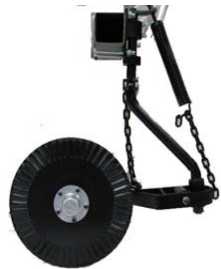
Single Disc Coulters—Set-under PWCOULTERSINGLEPL - 18" - Plain PWCOULTERSINGLEFL - 18" Fluted