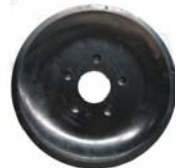
12" and 14" Hard Rubber Cheeks PWCOULCHEEK12 PWCOULCHEEK14